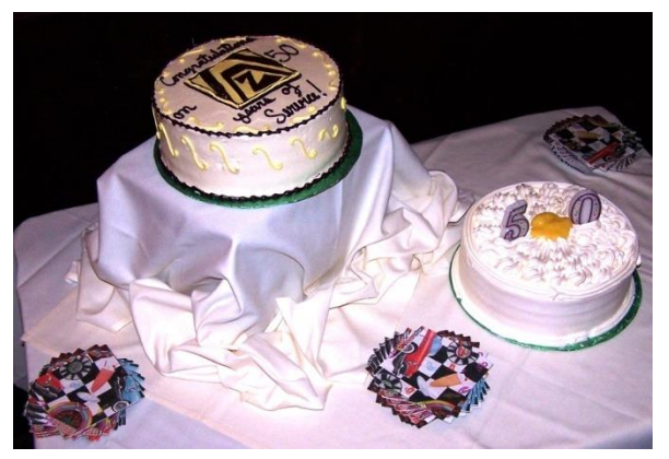
OCTOBER 2009 OUR 50<sup>TH</sup> ANNIVERSARY