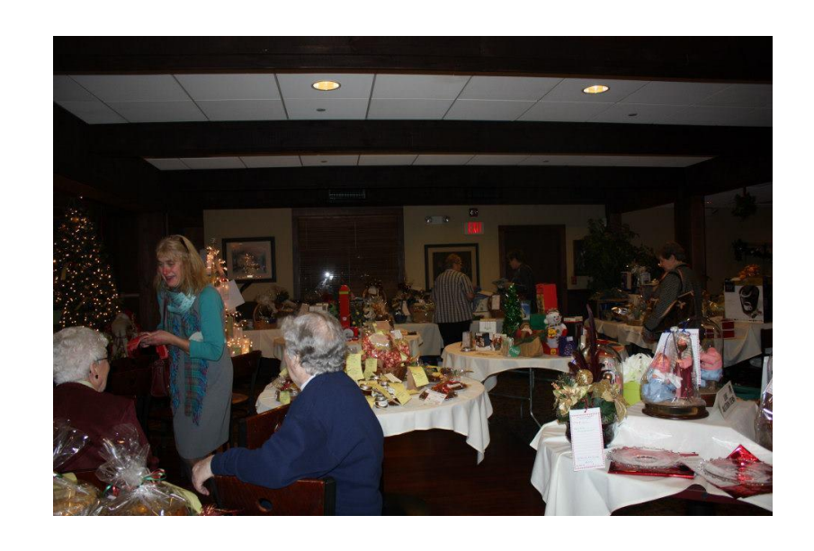
DECEMBER 2014 ~ THE RED BLAZER