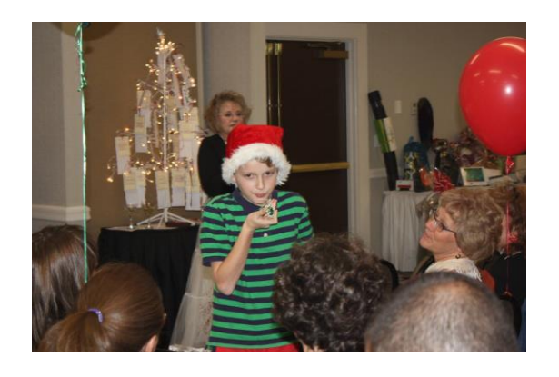
NOVEMBER 2018 GRAPPONE CENTER