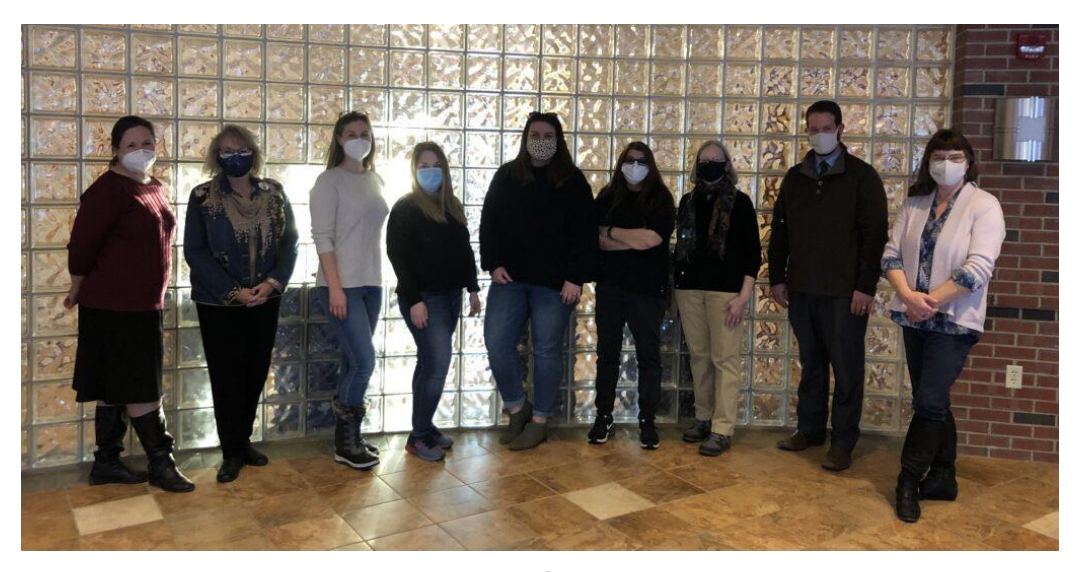
2021 NHTI, Concord's Community College Recipients

Beginning in 2020, the scholarship was advertised throughout the greater Concord & Manchester area as well as at NHTI.