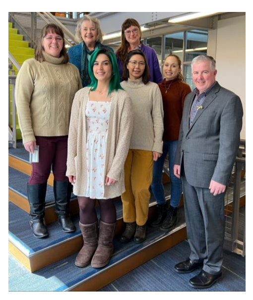
2022 Manchester Community College Recipients