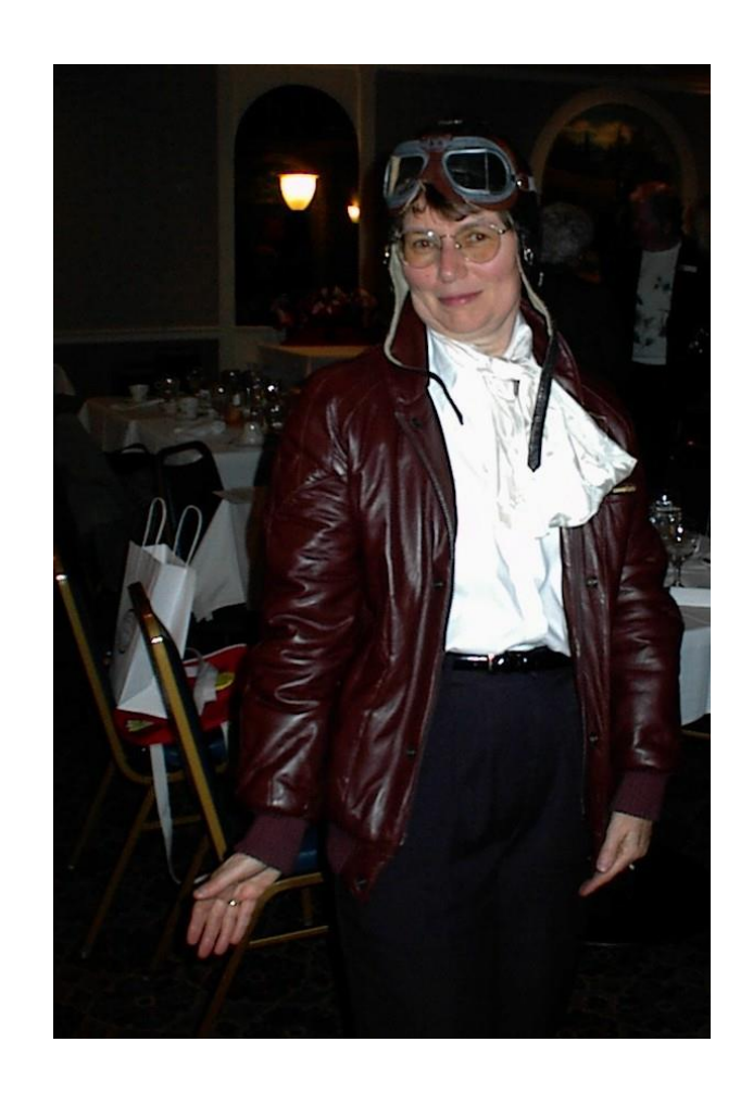
OTHER ZONTA MEMBERS CELEBRATE THE 45<sup>TH</sup> IN STYLE